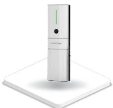
All-in-one Energy Storage System