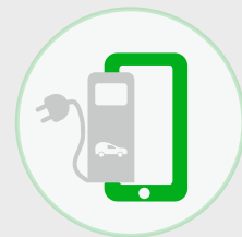
OTA Remote Access