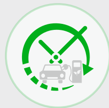
Time of Use Tariff