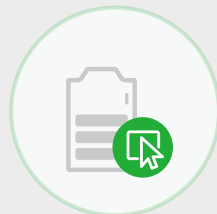
Functional With or Without a Battery