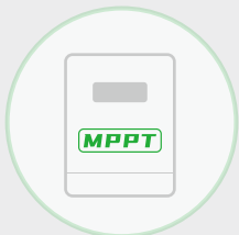
Built-in MPPT Solar Charger Controller