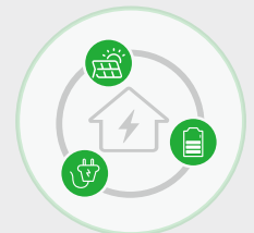
Automatically Switch PV/AC/Bat Priority