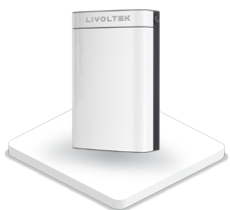
Residential Lithium Battery