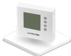
Optical LCD Screen