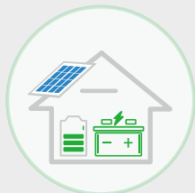
Lead-acid or Lithium Battery Compatible