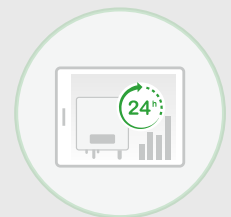
7*24 Remote Monitoring