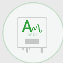
Optional AFCI Module